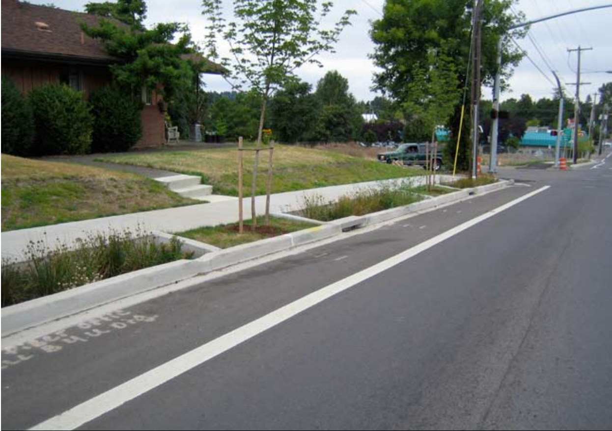
Streetscaping Project - 92nd Avenue