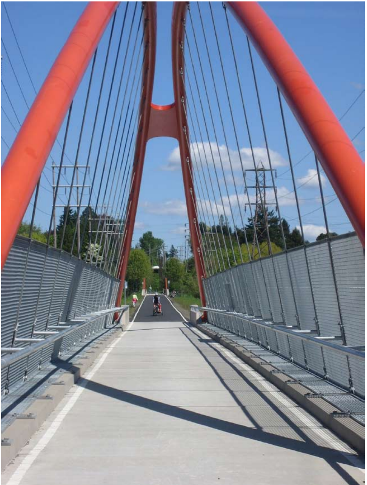
McLoughlin Bridge - Springwater Trail